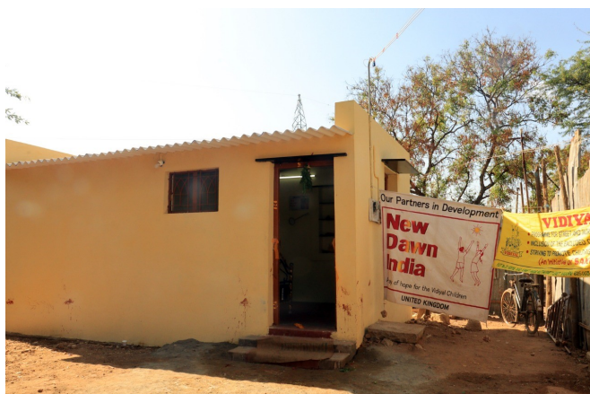
House warming ceremony

An SOS was sent to NewDawn India and we were able to step in and help with the funds needed to build a new home for the family. It was constructed with amazing speed and the family is delighted with the new home.